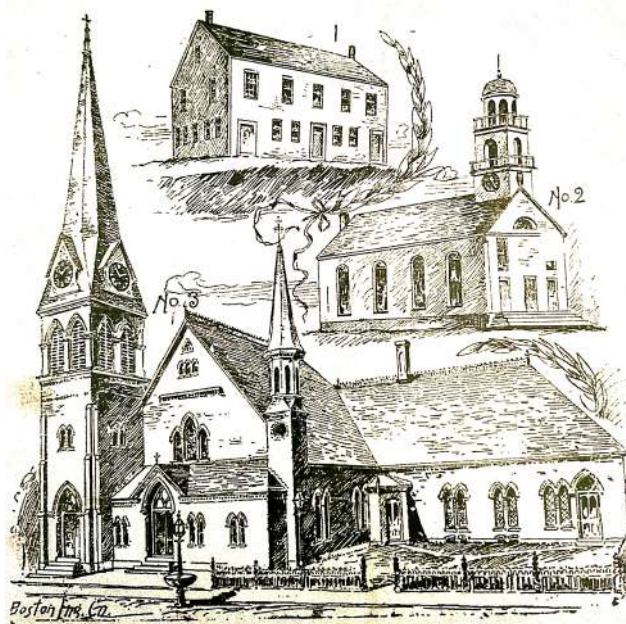
The Three Meetinghouses of the First Congregational Church, Pittsfield, New Hampshire