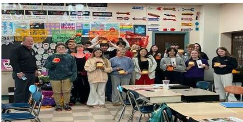
Tri-City Drivers' Education Class shows off LED roadside flares.

As a gesture to help young drivers, each student received a free three-pack of LED roadside flares to ensure they have emergency tools on hand.